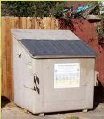
Possible manure storage container